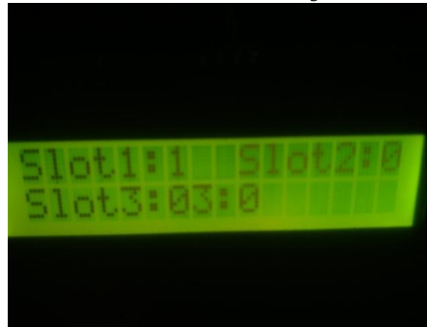
Figure 5.2 LCD displaying the vacancy of seats

The working of IR Sensor to detect the vacancy of seats is successful as the LCD Unit displays the seats which are full and the seats that are vacant as shown in Figure 5.2