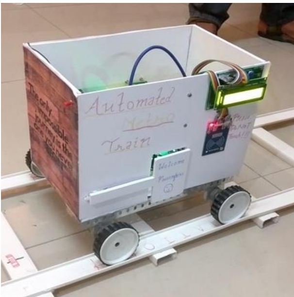
Figure 5.1 Train Stopped at a Station

The primary outcome of the working model is achieved; the working model has the reader installed, so when it read the signals from the tag placed near the station, it stops at the station. The door then opens for a predefined time and then closes.