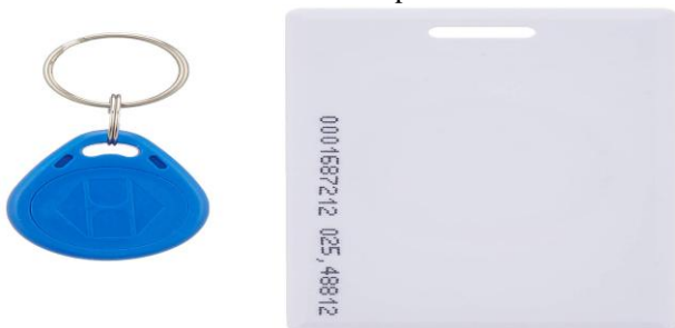
Figure 2.1 RF-ID TAG

It uses electromagnetic fields to automatically identify and track tags attached to objects. The tags contain electronically-stored information. Passive tags collect energy from a nearby RFID reader's interrogating radio waves. Active tags have a local power source (such as a battery) and may operate hundreds of meters from the RFID reader. Unlike a barcode, the tag need not be within the line of sight of the reader, so it may be embedded in the tracked object. RFID is one method for Automatic Identification and Data Capture (AIDC). A radio-frequency identification system uses tags, or labels attached to the objects to be identified as shown in Fig 2.1. Two-way radio transmitter-receivers called interrogators or readers send a signal to the tag and read its response. RFID tags can be passive, active or battery-assisted passive. An active tag has an on-board battery and periodically transmits its ID signal. A battery-assisted passive (BAP) has a small battery on board and is activated when in the presence of an RFID reader[2]. A passive tag is cheaper and smaller because it has no battery; instead, the tag uses the radio energy transmitted by the reader. However, to operate a passive tag, it must be illuminated with a power level roughly a thousand times stronger than for signal transmission. That makes a difference in interference and in exposure to radiation.