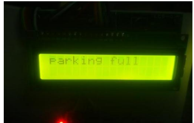
Figure 5.3 LCD displaying all seats occupied

The situation when the train is filled to capacity is displayed as parking full by the LCD Unit as shown in Figure 5.3.